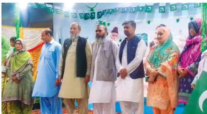
KPT schools marked the 77 th Independence Day with great enthusiasm, showcasing a deep sense of love and loyalty to the nation. The celebrations honored the sacrifices of our forefathers in the struggle for independence. Students delivered inspiring speeches, performed patriotic songs, and showcased a colorful tableau, reflecting their pride and commitment to Pakistan. The event served as a poignant reminder of our shared history and the values that continue to unite us as a nation.